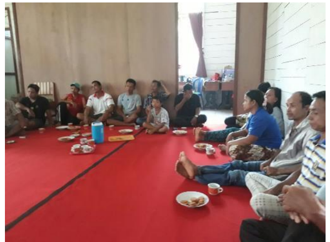
Meganesia Tirta Foresta also carried out Free Prior Informed Consent (FPIC) activities amongst the villagers and settlers as part of their procedures in assessing HCS