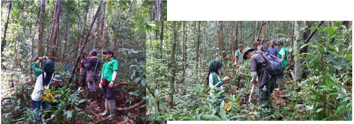
Meganesia Tirta Foresta conducting a HCS assessment. One of the activities undertaken was the identification of wood and plants to assess the carbon stock value in the area.

As a commitment to the concept of sustainable plantation development, KAP has appointed PT. Meganesia Tirta Foresta, whose team and personnel have been registered at High Carbon Stock (“HCS”) Network to conduct High Carbon Stock Assessment. Land clearing activities will follow based on the results and recommendation of the independent High Carbon Stock Assessment.